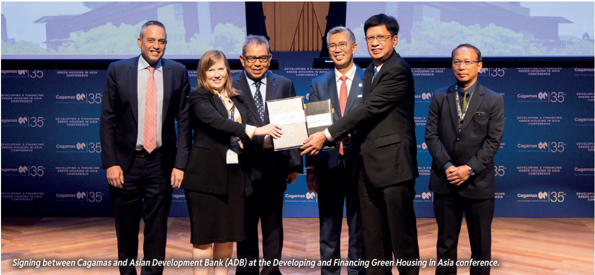
Signing between Cagamas and Asian Development Bank (ADB) at the Developing and Financing Green Housing in Asia conference.

Following the launch of its reverse mortgage scheme in 2021, Cagamas introduced Skim Saraan Bercagar Islamik