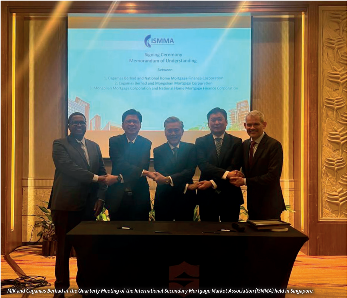
MIK and Cagamas Berhad at the Quarterly Meeting of the International Secondary Mortgage Market Association (ISMMA) held in Singapore.