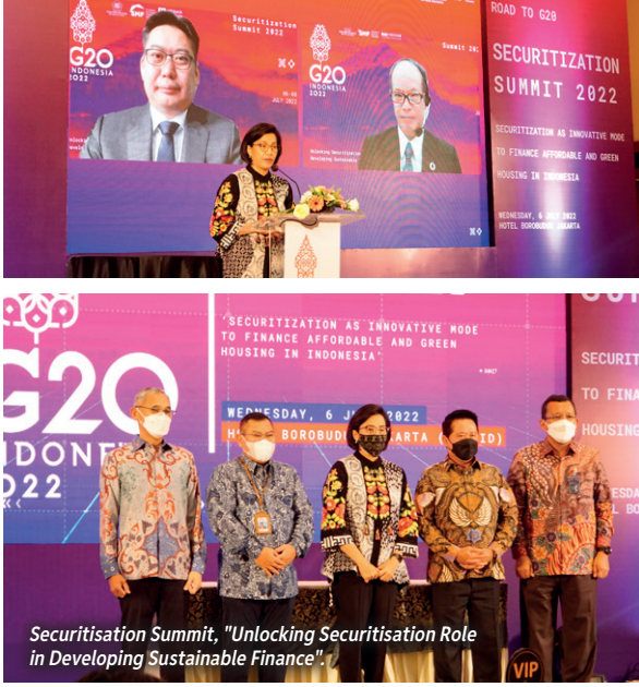
Securitisation Summit, "Unlocking Securitisation Role in Developing Sustainable Finance".

In 2023, SMF also issued the first Indonesia social bond amounting to IDR 8 Trillion (USD 532 billion) with use of proceeds to promote home ownership and increase the supply of affordable housing projects targeting low-income earners (MBR).