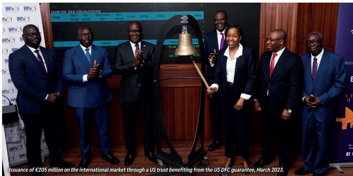
Issuance of €205 million on the international market through a US trust benefiting from the US DFC guarantee, March 2023.

Proceeds from the local bond issuance and loan proceeds from international fundraising are blended to provide refinancing to local banks’ mortgage portfolios for affordable housing.