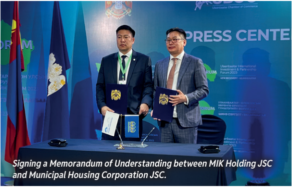
Signing a Memorandum of Understanding between MIK Holding JSC and Municipal Housing Corporation JSC.

sector, including NHMFC and Cagamas Berhad, signed a Memorandum of Understanding. This collaborative effort aims to leverage collective knowledge and experience to bolster support for both primary and secondary mortgage markets on an international and regional scale. MIK anticipates this initiative will benefit the financing system, mortgage-backed bond market, information exchange, market expansion, and overall growth in the mortgage sector.