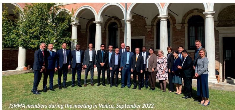
ISMMA members during the meeting in Venice, September 2022.

This meeting presented the opportunity for ISMMA members to discuss their future expectations for the Association. Following discussion sessions on Members' Expectations, Membership Services/ Governance/ Budget and Discussion on Knowledge Management, Website and Training , the members decided to form a Strategy Committee to develop a shared vision for potential services and future development of ISMMA.