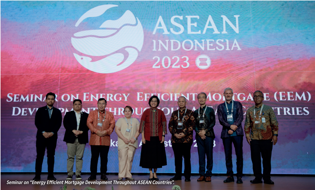
Seminar on "Energy Efficient Mortgage Development Throughout ASEAN Countries".

The Japan Housing Finance Agency (JHF) has been issuing green bonds since 2019, and the total issue amount reached 1.025 trillion yen as of September 2023.