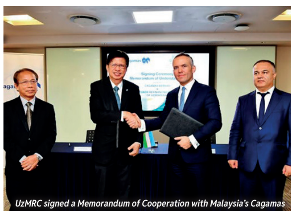
UzMRC signed a Memorandum of Cooperation with Malaysia's Cagamas

ADB in December 2022. As at the end of Q3 2022, UzMRC has refinanced USD 200 mn worth of mortgage loans supporting 16,000 homeowners, 30% of which were women. UzMRC contributed to several legislative initiatives, including new capital markets rule shelf-registration of bond programmes, law on electronic mortgage deeds and law on covered bonds and securitisation. In Q1 2023, following lengthy negotiations and the assessment of UzMRC's operations, CBU introduced a regulatory provision whereby, UzMRC's unsecured bonds would be risk weighted at 20% on the banks' balance sheet and its secured bonds would be treated as HQLA.