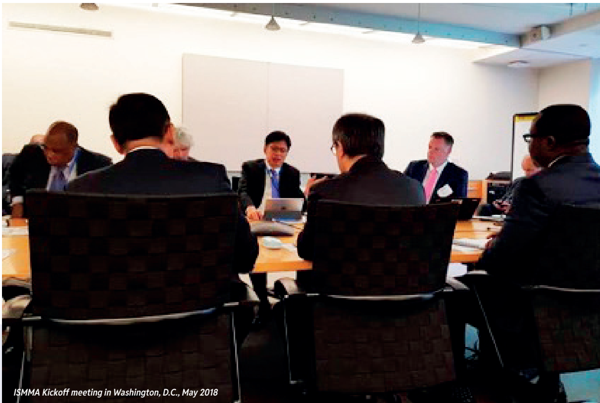
ISMMA Kickoff meeting in Washington, D.C., May 2018

Institutional membership of ISMMA is open to all secondary mortgage market associations around the world, Observer membership being open to all other interested parties. The ISMMA Secretariat moved from the World Bank Group to the European Mortgage Federation – European Covered Bond Council (EMF-ECBC) on 1 July 2022.